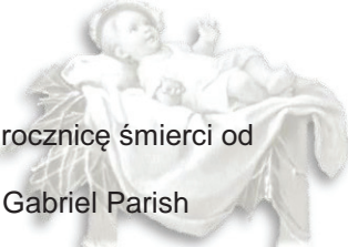
Solemnity of the Nativity of the Lord